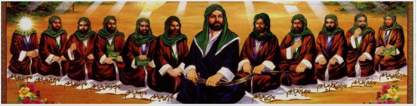
The Twelve Imams, each representing a different aspect of the Universe, is a common Alevi belief.