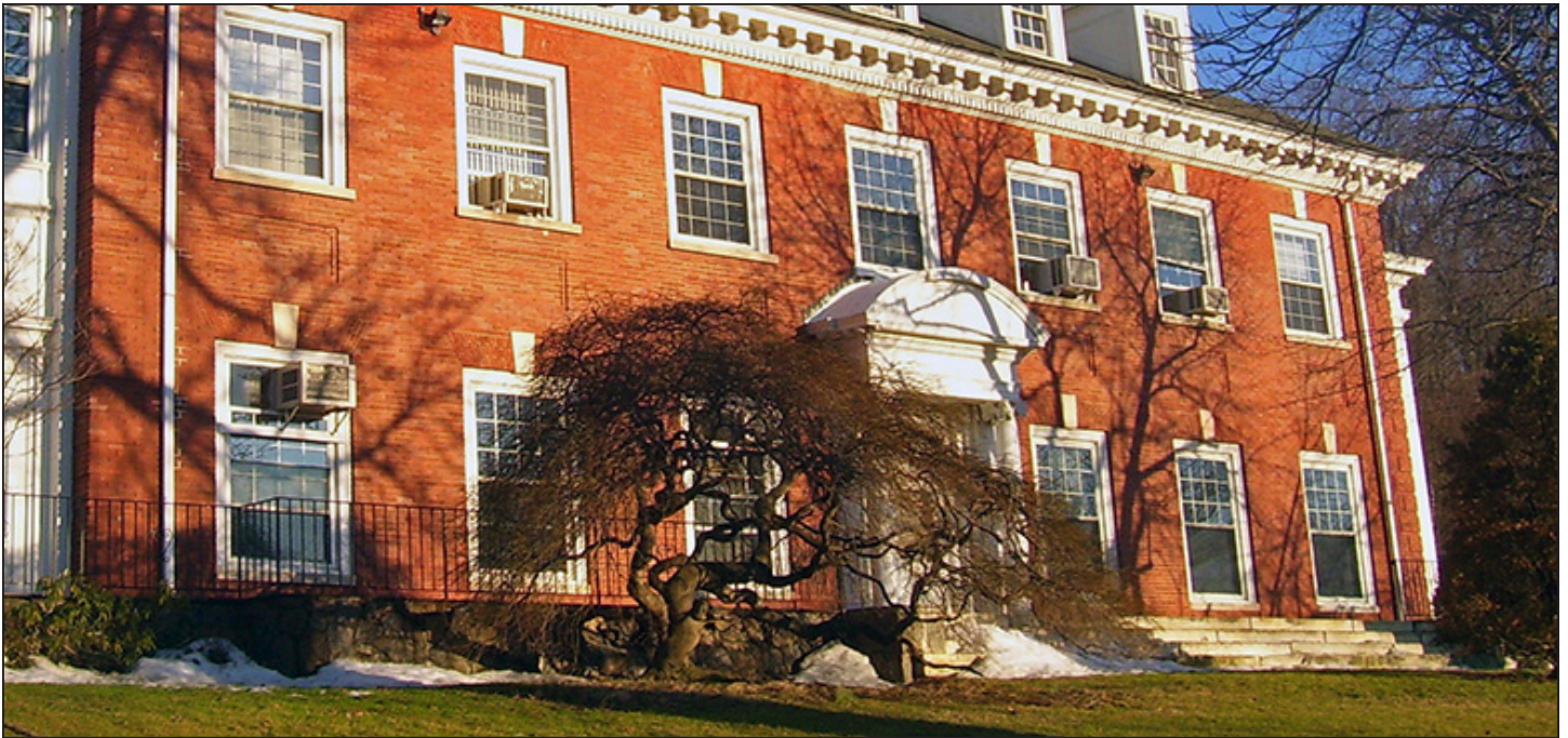
The Edward Harden Mansion in New York is the site of the first American Montessori school, founded in 1911.