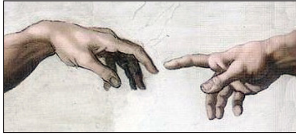
The Creation of Adam, a fresco painting by Michelangelo, decorates the interior of the Sistine Chapel in Rome. // SOURCE: 1a2b3c? via Wikimedia Commons

The article reveals that not only evangelical types of creationism are found in Europe: there are also instances of Catholic, Orthodox, Muslim and even Vedic forms of creationism. Acceptance of biological evolution is much higher in all European countries (and Japan) than in the United States, with the exception of (partly European) Turkey, where belief in evolution is significantly lower than in the United States. But often overlooked is the fact that in most European countries, at least 20 percent of the population rejects evolutionist teachings. Organized creationism is relatively recent in Europe; in Scandinavia, it did not emerge before the 1980s. While the authors admit that a number of recent developments in the field of creationism in Europe started as the result of proselytization by large U.S. young-earth organizations, there have also been local efforts and, moreover, U.S. creationism is adopted without significant local adjustments. One example of an adaptation to local and social environments is in Turkey, where Christian references were removed in translated American creationist literature. If such teachings are associated with American origins, creationism can only be perceived of as an alien belief phenomenon with limited influence.