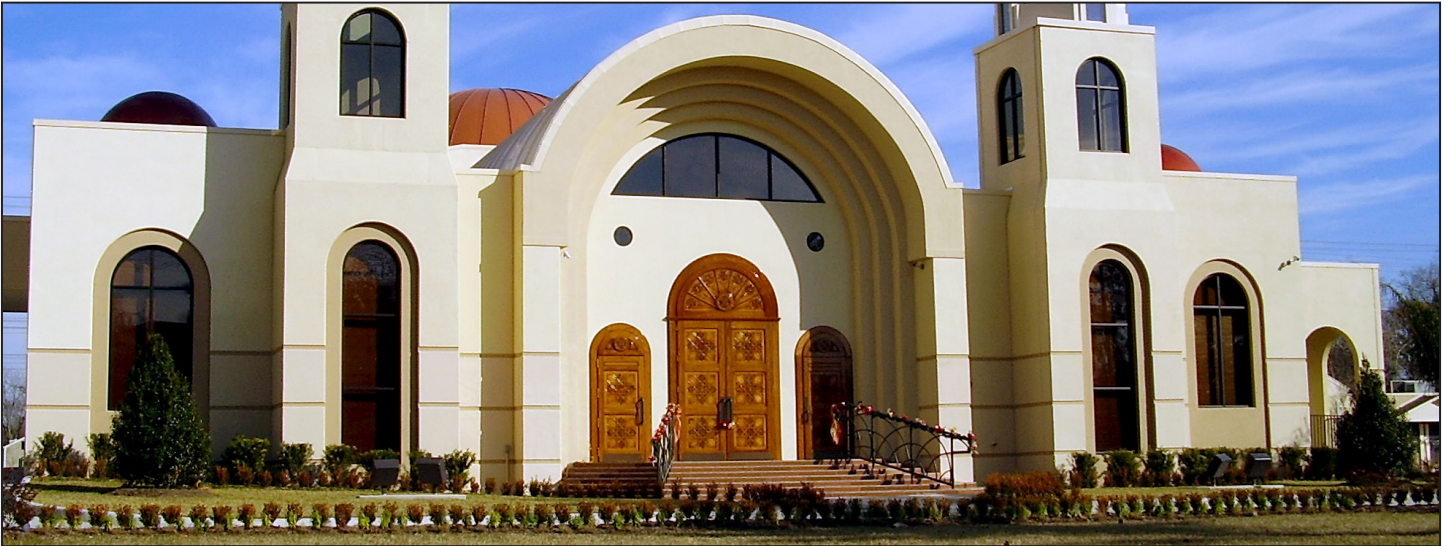
St. Mark Coptic Orthodox Church in Bellaire, Texas.