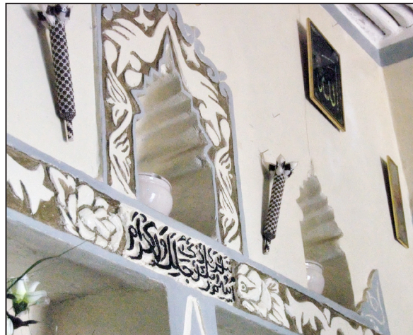
A home in Harar, Ethiopia, with Islamic calligraphy below the niche.

( Journal of the American Academy of Religion , 825 Houston Mill Road, Suite 300, Atlanta, GA 30329 - http://jaar.oxfordjournals.org/ ). ■