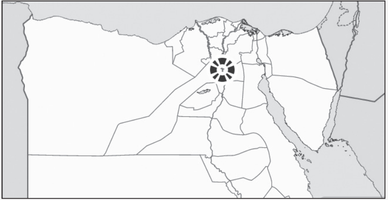
Map of Egypt with capital city Cairo circled

Bishop Tawadros, the Coptic pope appointed last November, has supported such ecumenical initiatives, whilst the Internet and satellite TV (i.e. California-based network Alkarma) has "played a role in the spiritual groundswell." Many of these prayer gatherings started underground in the 1990s and early 2000s but have gradually taken on a more public pres-